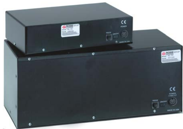
Rear view of MultiStation models ML-2U and ML-4U

■ Phone: 281-933-7673 ■ E-mail: sales@rose.com ■