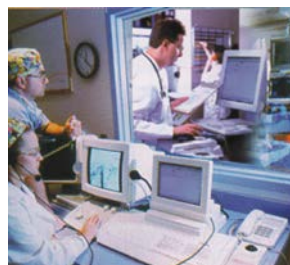
Medical or dental personnel access a computer from multiple locations

The MultiStation has a variety of other features to fine-tune your application. Call us to find out how the MultiStation can simplify your computer access.