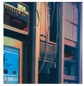
Perfect for server rooms

Once you install the UltraMatrix its value increase since it has flash memory. Firmware updates are available from rose.com. This ensures your product will be compatible with the newest products and technologies. Call us today for more information on this and other Rose products.