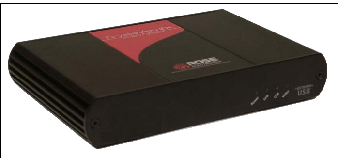
Figure 1.Transmitter Front Panel

The CrystalView EX DVI comes in a single model as shown below.