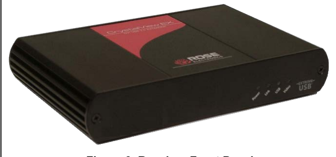
Figure 3. Receiver Front Panel