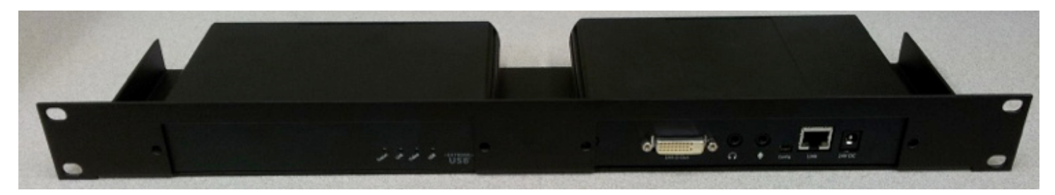
Figure 5. Two CrystalView EX DVI Transmitters in a 1U rack shelf