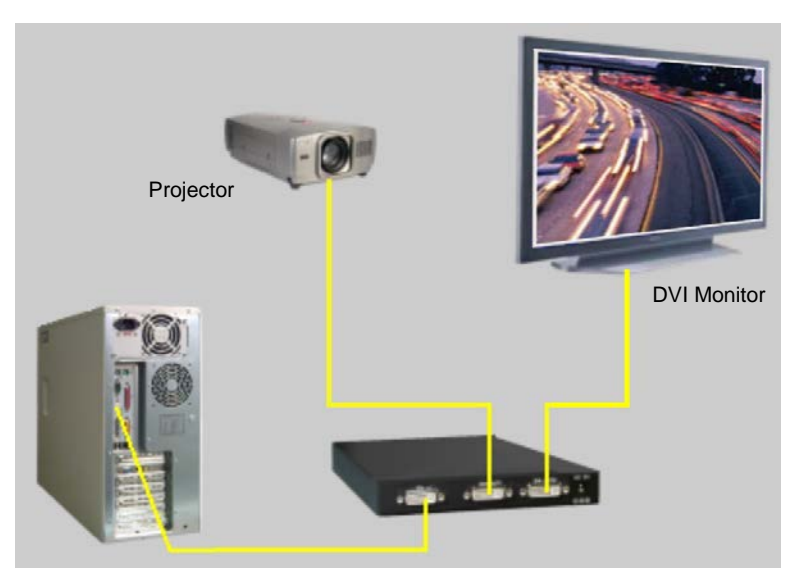
Figure 2. Basic Installation

Finally, connect the power adapter to the VideoSplitter DVI unit, turn on all the monitors and boot the computer last. You should see the boot-up sequence on all monitors.