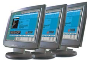
Drive multiple monitors From 1 or 2 computers

The VideoSplitter is rack mountable with optional 19", 23", and 24" rack mount kits.