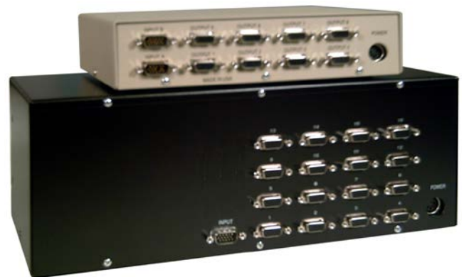
VSP-2X8VB model (top) / VSP-1X16VB model (bottom)

■ Phone: 281-933-7673 ■ E-mail: sales@rose.com ■