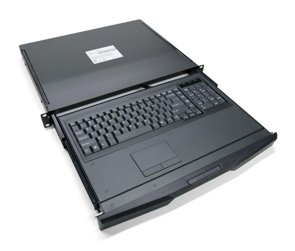
RackView Keyboard Drawer standard depth with touchpad