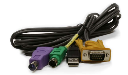
RackView Keyboard Drawer cable kit

The product is often paired with a RackView Panel Mount monitor to make a complete KVM station. This gives the benefit of having the LCD display always present, and the keyboard can hide away when not needed.