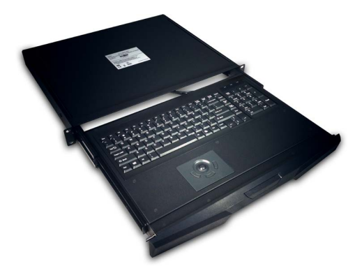
RackView Keyboard Drawer standard depth with trackball