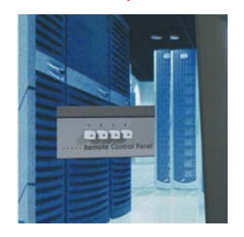
Connect to a CPU with the push of a button

Video switching applications, presentations, training sessions, and many other applications are made easy by using the push-button features of the Remote Control Panel.