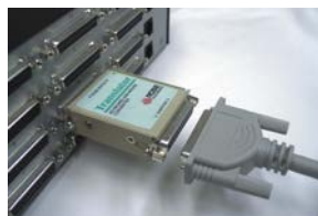
Connects directly to a Rose switch to support Apple, Sun, DEC Alpha, and SGI Onyx

The Translator is used with Rose UltraCable to provide the cleanest solution to connecting your computers. Give us a call to find out more about the Translator and how it will work in your application.