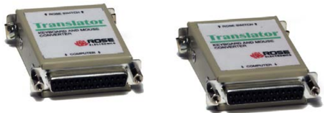
Models for Apple, SUN, DEC, SGI Onyx

■ Phone: 281-933-7673 ■ E-mail: sales@rose.com ■