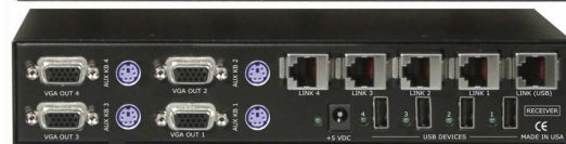
Receiver With auxiliary PS/2 Keyboard input

NOTE: Aux keyboard input (USB or PS/2) are for video adjustments only.