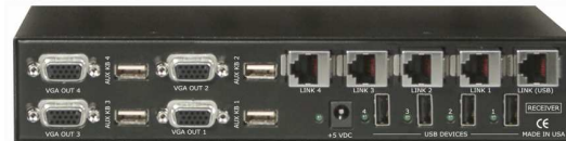
Receiver With auxiliary USB Keyboard input