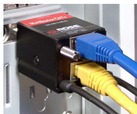
Connects directly to a PCs Video, keyboard, and mouse ports