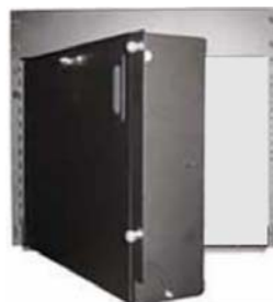
Unit swings open for easy access into the rack

PC, UNIX, Sun, and Apple computers can easily be accessed, monitored, and controlled locally using RackView panel mount.