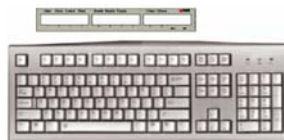
The ClassView keyboard template simplifies the teacher's access to the student's computers

Easy to install, easy to use, ClassView provides the modern way to teach in today's electronics classroom. Call us today to learn more on how ClassView can improve your training applications.