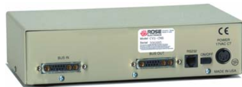
Rear view of ClassView model CVT

■ Phone: 281-933-7673 ■ E-mail: sales@rose.com ■