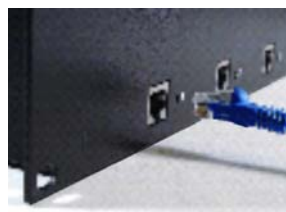
Standard CAT5 connectors

The CrystalView Rack is designed for plug-and-play operation. Connect the computers, a KVM station, and a CAT5 cable between the local and remote units, and its ready to use.