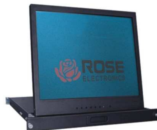
1U Rackmount monitor

PC's, UNIX, Sun, Apple, and USB computers can easily be connected and monitored locally using the RackView monitors.