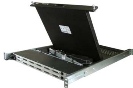
RackView with optional KVM switch

Environmental 32°F - 122°F (0° - 50° C), 20%-80% non-condensing RH