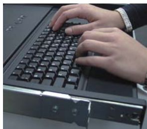
Easy access right at the rack

PC's, UNIX, Sun, and Apple computers can easily be accessed, monitored, and controlled locally using RackView.