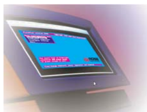
UltraView Pro on-screen menu

With its advanced on-screen menu system, built-in security, flash memory, easy expansion, front panel controls, and other features you start to get a sense of the UltraView Pro advantage.