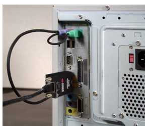
Direct connect CAT5 Transmitter streamlines your installation

As the inventors of the KVM switch, Rose continues to provide leading solutions for your server management needs. With headquarters in the US and offices in Europe and Asia, Rose provides a full range of capabilities and support. Call us today for more information about this and other Rose products.