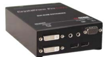
CrystalView DVI CATx (USB model)