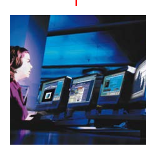
Perfect for Trading Room Floors

Call us today to find more about the MultiVideo's unique capabilities.