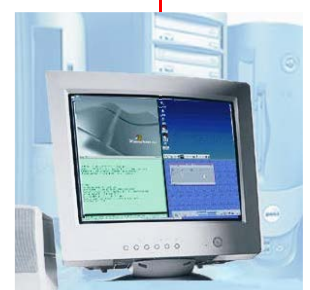
Real-time quad view

Be more productive, organized and efficient with the dynamic, new QuadraVista 2, Quadvideo KVM Switch, from Rose Electronics.