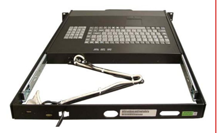
Rackview Rear Slide Extension