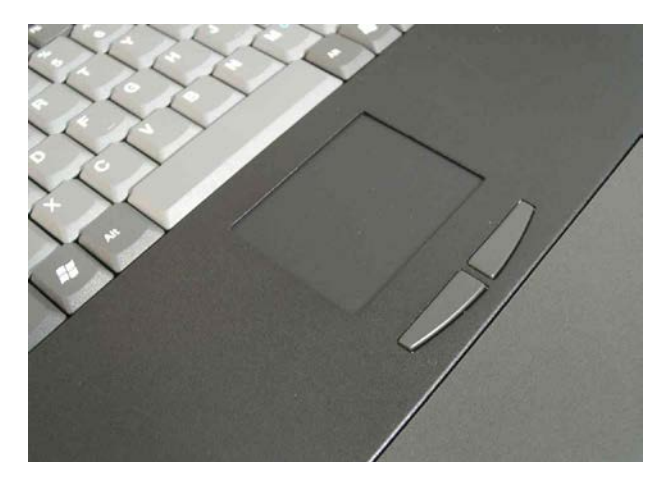
Rackview Touchpad Mouse

The RackView can be placed at any height within a standard 19" rack. This offers the operator the maximum in comfort and takes up a minimum amount of rack space. The front panel conceals the unit when it is not in use.